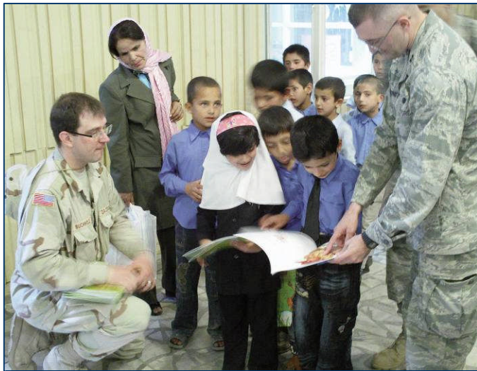
Above: A matching grant and contributions from family and friends enabled these students above at Amani High School in Kabul to receive Dari-Pashto books donated by soldiers from Camp Eggers inside Afghanistan.

In addition, thanks to a $10,000 matching grant from the Reid Foundation, 8,818 books have been distributed in Afghanistan this year by Provincial Reconstruction Teams (PRTs), deployed with our troops over there.