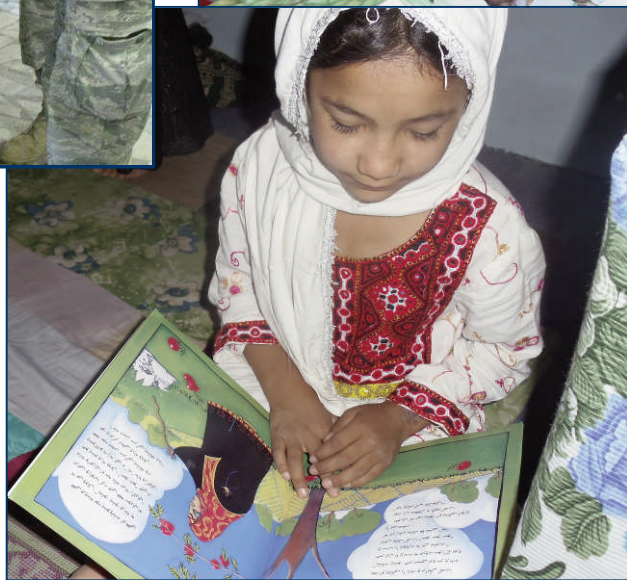
Opposite and Above Right: Girls at Kabul Orphan Care enjoy reading one of the 1,500 Hoopoe books delivered to children in 2010.